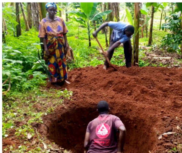
Above, a new pit latrine under way. Below, a completed latrine

We are pleased to report that another pit latrine is almost completed for a family who could not afford this facility. Plans are also under way to begin work on another latrine.